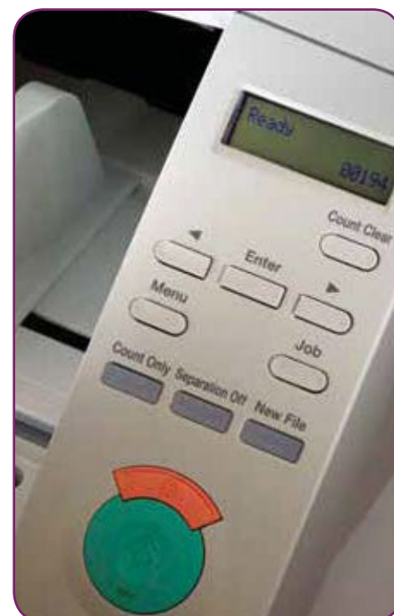
User-friendly control panel

Both the DR-G1130 and DR-G1100 come with an array of intelligent image processing features, including advanced deskew to straighten documents that are fed in at an angle, MultiStream to create dual image outputs for OCR applications and Character Emphasis to improve legibility for better OCR recognition.