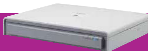
A3 Flatbed Scanner unit 201