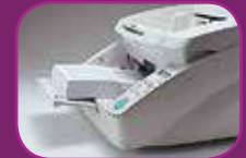
Lowest position (500 sheets)