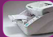
Highest position (100 sheets)

The document feeder has three selectable feeding modes (100, 300 and 500 sheets) that are adjustable according to the volume of the batches being scanned, saving time and increasing overall throughput.