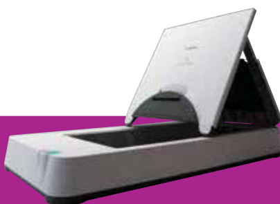
A4 Flatbed Scanner Unit 101

Scan bound books, journals and fragile media by adding the Flatbed Scanner Unit 101 for documents up to A4 or Flatbed Scanner Unit 201 for A3 scanning. Connected by USB, these flatbed scanners work seamlessly with the DR-G1130 and DR-G1100 in a smooth dual-scanning operation that lets you apply the same image-enhancement features to any scan.