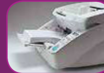
Middle position (300 sheets)